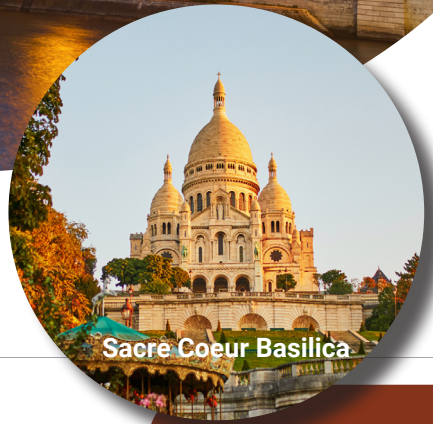
Sacre Coeur Basilica

“Share incredible moments of deep reflection, cultural discovery, and Spiritual Renewal! ”